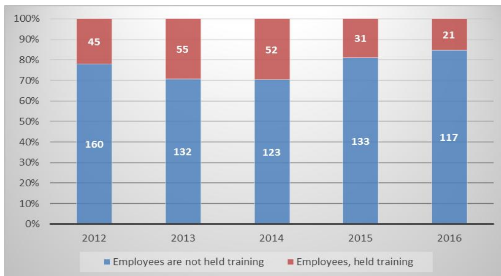
Fig. 3. Dynamics of the Staff Structure of JSC «Volyn-AUTO» in 2012 – 2016 Years, %

institutions on the basis of contracts. However, with a decrease of the employees number tends to reduce their teachings.